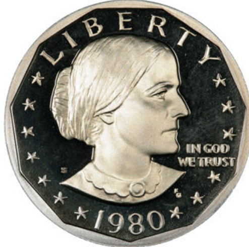
Susan B. Anthony dollar