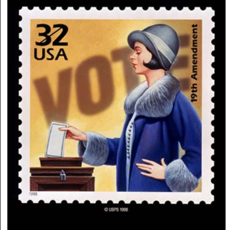
Postage stamp celebrating the 19 th Amendment

“Woman must not depend upon the protection of man, but must be taught to protect herself.”